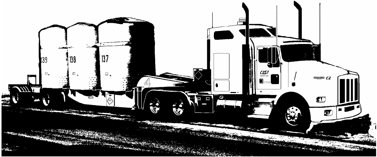
Figure 2 Cutaway of TRUPACT II Container